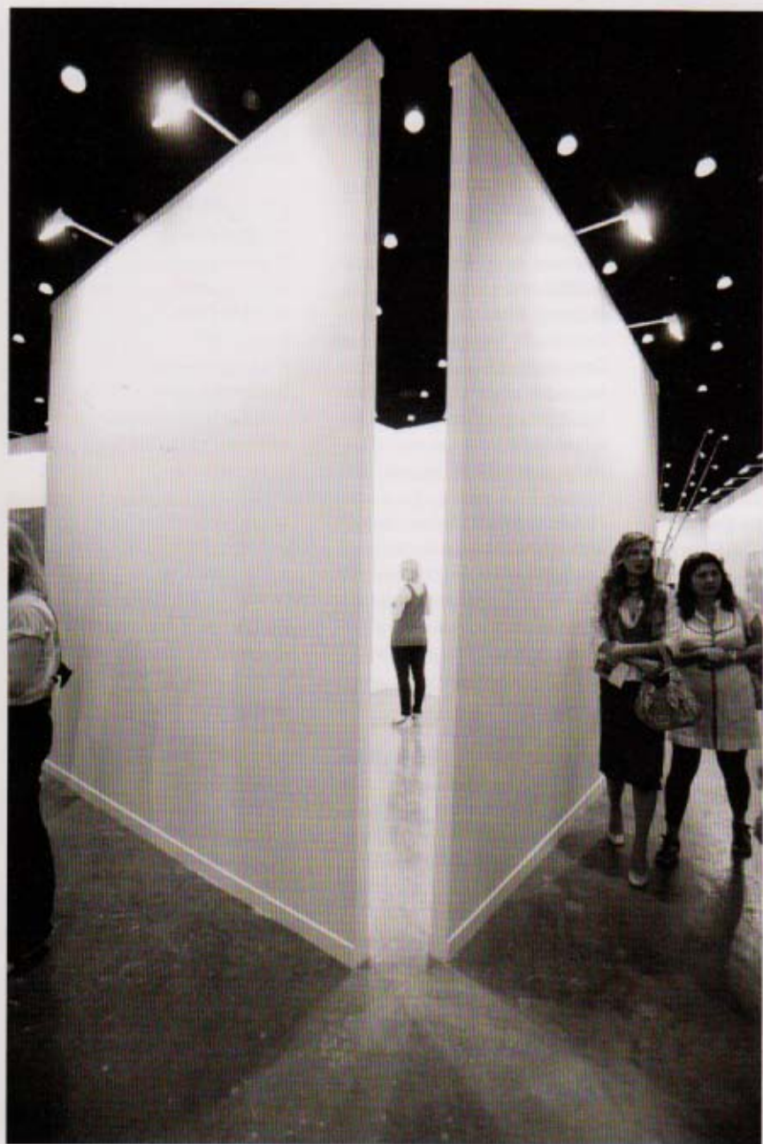
White Elephant by Oraib Toukan, installation shot Dubai Art Fair 2011.